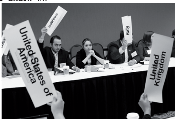
SC discusses Oil Crisis

knowing who was responsible for the attacks. Eventually Israel took full responsibility for the bombing raid and acknowledged a condemnation from the Security Council, clearing the way for the introduction of the draft resolution.