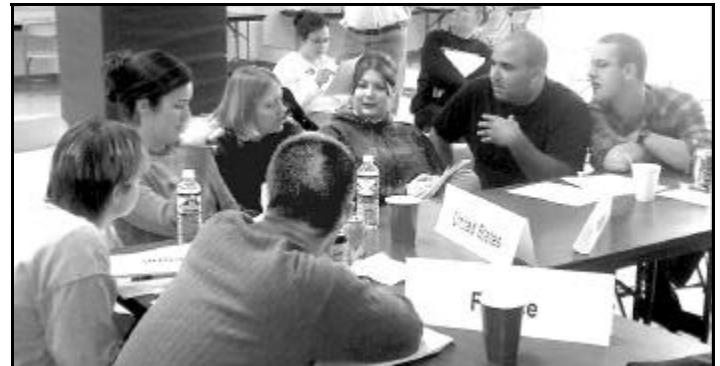
AMUN Secretariat members discuss aspects of professionalism during the 2001 Labor Day Staff Training Weekend.

If I am selected for the Secretariat, what will be required of me?